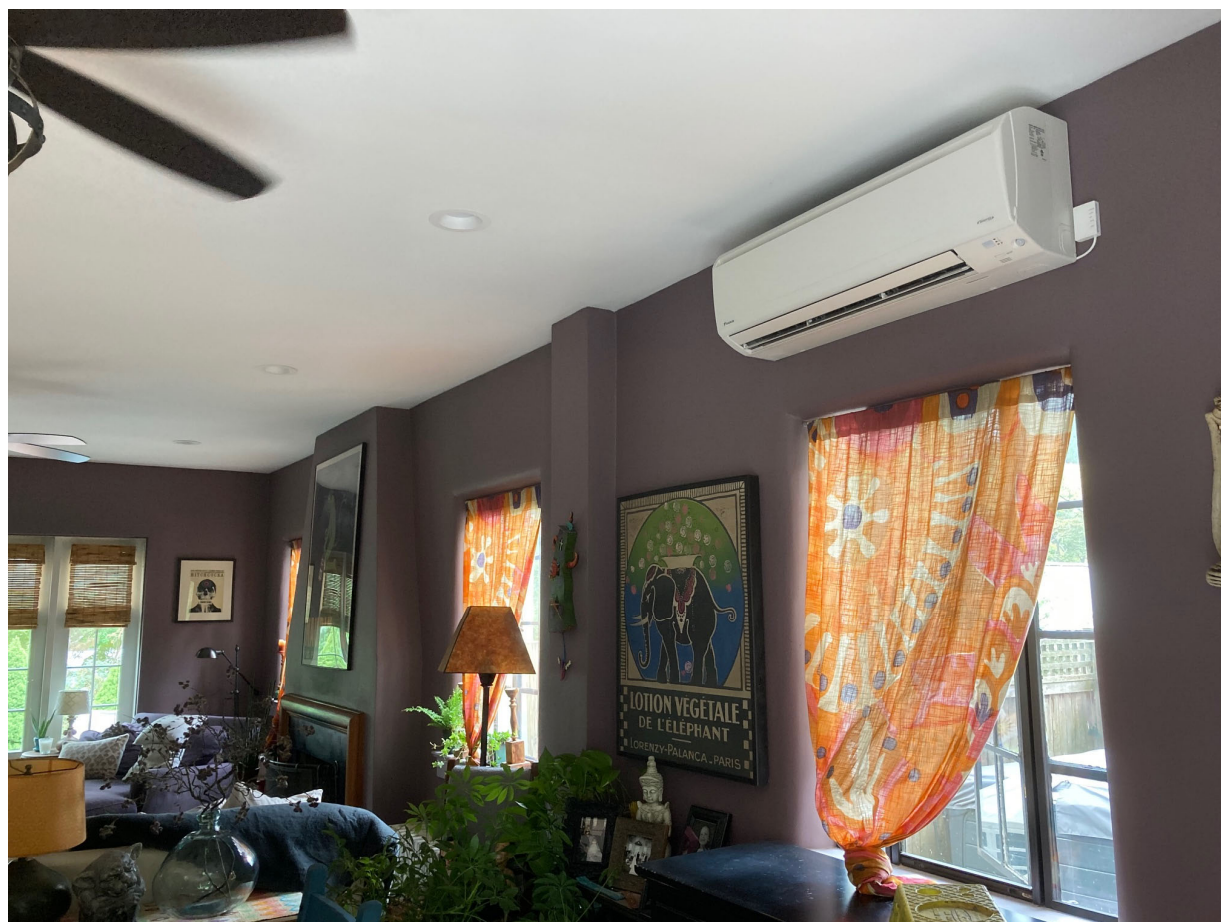
High Wall Mount