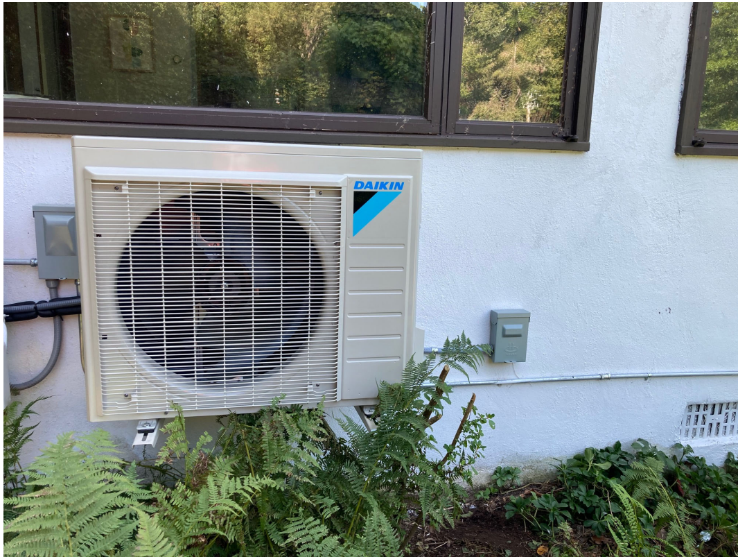
Wall mounted heat pump