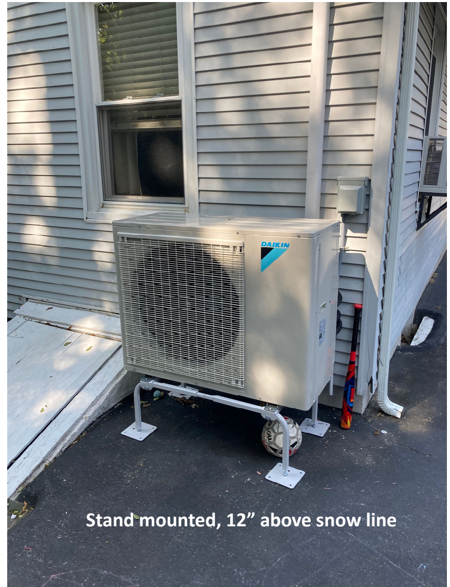
Stand mounted, 12" above snow line